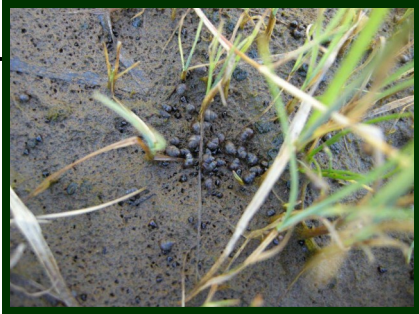
Group of A.P Snails