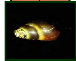
↑ A.P Snail