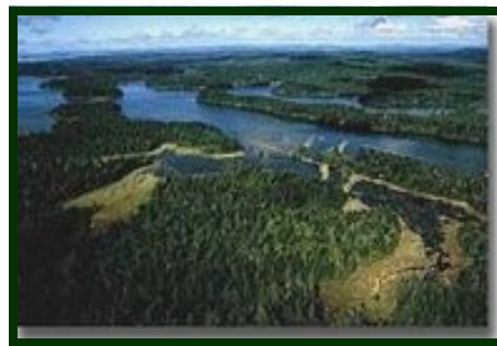
South Slough Estuary

Created by Mapleton High School Sophomore Biology Class 2011