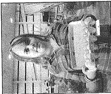
Backyard chickens are an easy 4-H project, and home-produced eggs are nutritious and delicious.