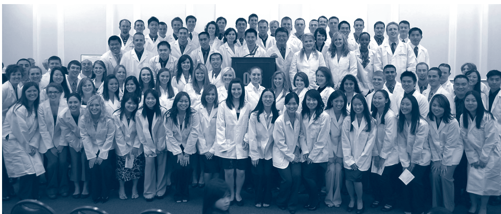
P1 students pose in their white coats.