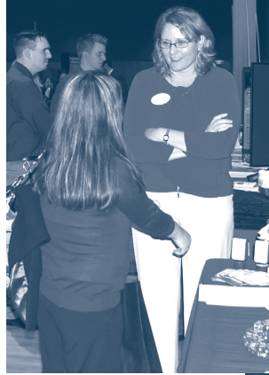
A company representative and student discuss career opportunities for students at Career Days.

Nearly 25 companies met with P4 students in Portland at the Center for Health and Healing in the second installment of Career Days in February. P4 students networked and interviewed for job opportunities. ♦