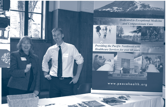
PeaceHealth representatives provide information to students.